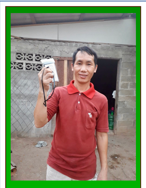
All over the world this gospel is bearing fruit and growing, just as it has been doing among you since the day you heard it and understood God's grace in all its truth. Colossians 1:6