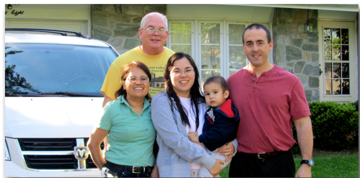
Leaving for the airport May 2011

The Hmong believers have welcomed us back warmly. We even met a new family of believers the first Sunday we returned. Most of the families have been busy working in their fields, so when the church meets together on Sunday the average attendance has been about six people.