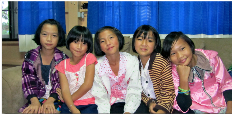
Five out of the six Hmong girls who came to our computer learning center