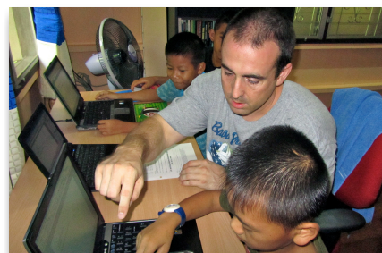
Hmong kids in our computer center