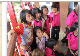
Hmong school, teaching English

We're expecting our 2nd child, a girl, in late November.