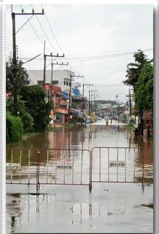
Flooding closed the main street